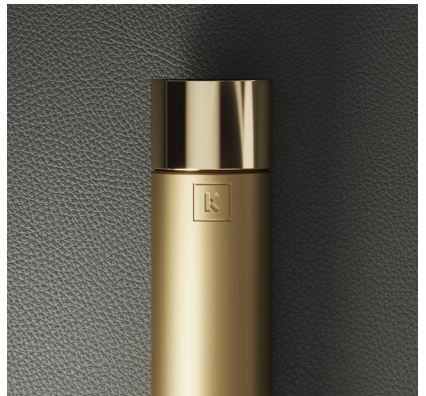
BRUSHED GOLDEN STAINLESS STEEL