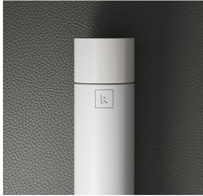
MATT TEXTURED WHITE IRON