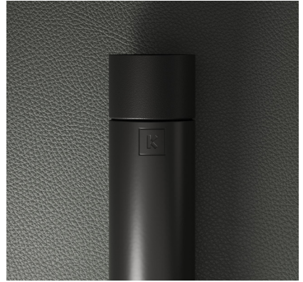
MATTE BLACK IRON