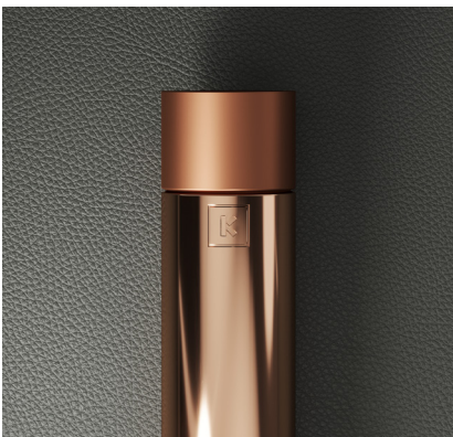
COPPER POLISHED STAINLESS STEEL