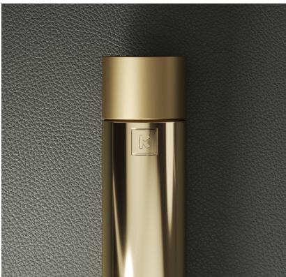
POLISHED GOLDEN STAINLESS STEEL