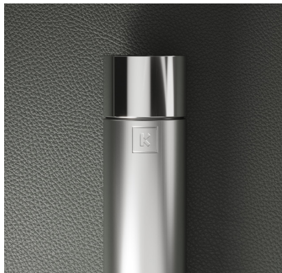
STAINLESS STEEL BRUSHED