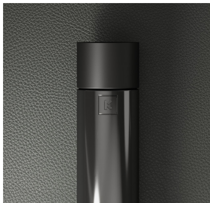
POLISHED NICKEL-PLATED STAINLESS STEEL