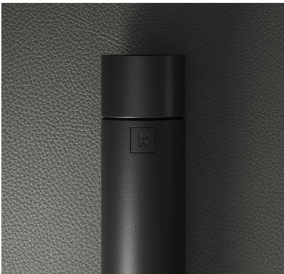
TEXTURED BLACK IRON