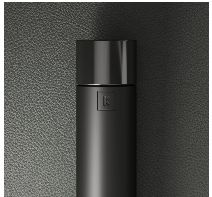
MATT NICKEL-PLATED STAINLESS STEEL