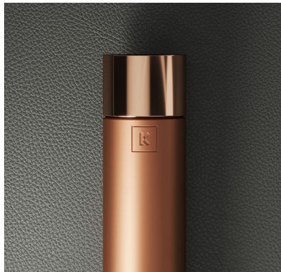
MATT COPPER-PLATED STAINLESS STEEL