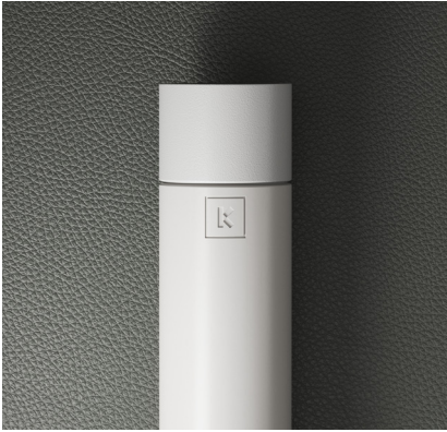
MATT WHITE IRON