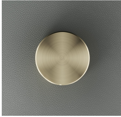
GOLD SPIRAL STAINLESS STEEL